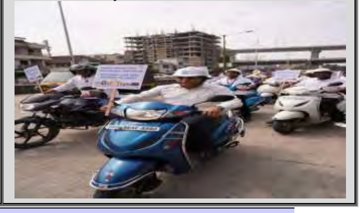
हमारासंकल्प - ग्राहकमूल्यसृजन Our Ethos - Customer Value Creation