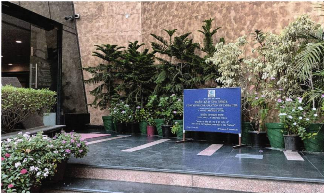
(Display of Standee during Vigilance Awareness Week - 2023) [Photo-A17]