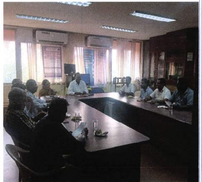
(Grievance Redressal Camps organized at ICD, Tondiarpet, Chennai) [Photo-A15]