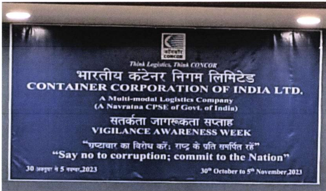
(Display of Banners during Vigilance Awareness Week – 2023) [Photo-A16]