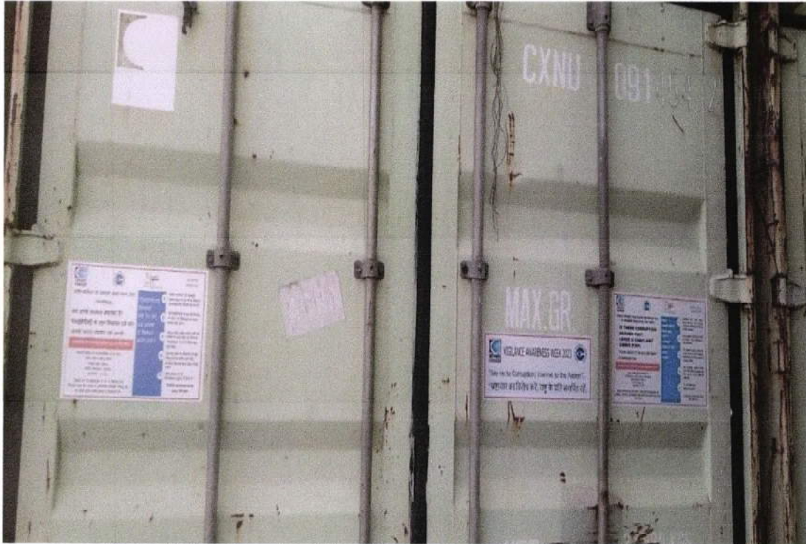
(Domestic Container with VAW-2023 theme & PIDPI stickers) [Photo-A11]