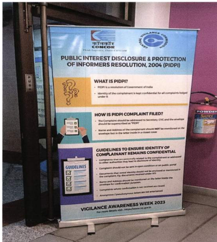
(Display of PIDPI Standee during Vigilance Awareness Week - 2023) [Photo-A19]