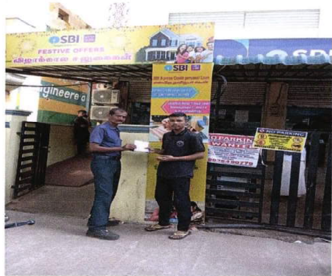
Distribution of Pamphlets by Area-III/South) [Photo-A20]